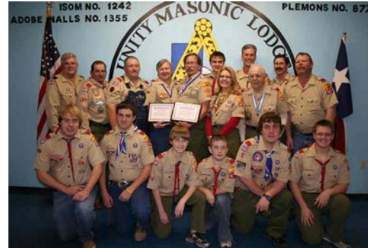
Hutchinson County Scouts and Scoutmasters

The Scouting Award is presented from the Grand Lodge of Pennsylvania and is approved for presentation to Texas Masons by the Grand Lodge of Texas.