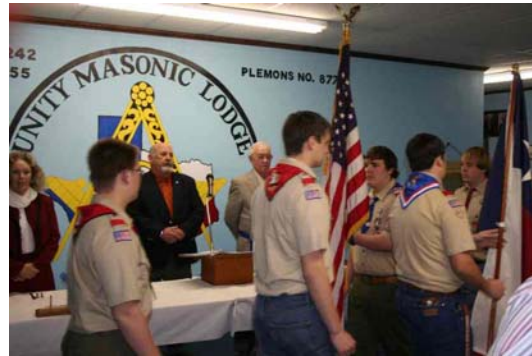
The flags were presented by members of the combined Boy Scout Troops of Hutchinson County.

On Friday February 6, 2009, Unity Lodge presented the Daniel Carter Beard Award. The award is presented to those Masons who have served their lodge and the youth of the Boy Scouts of America.