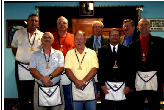
Borger Council Officers for 2010-11