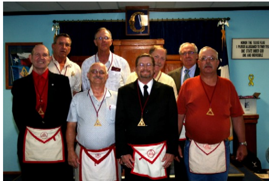
Borger Chapter Officers for 2010-11