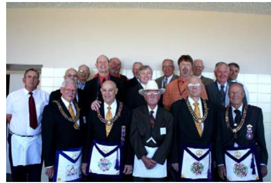
Officers of Unity #1242 for 2010-11

All the Officers for Unity #1242 were present for the installation by the Grand Master.