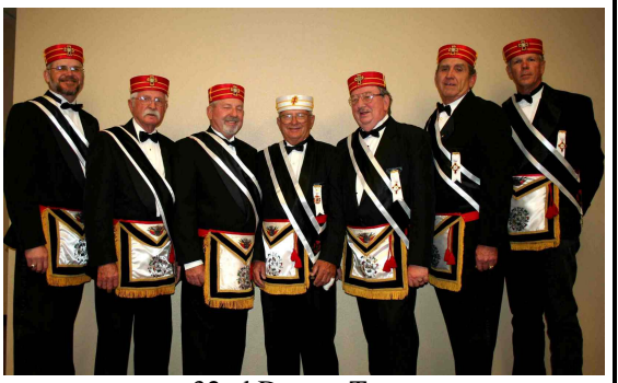
32nd Degree Team