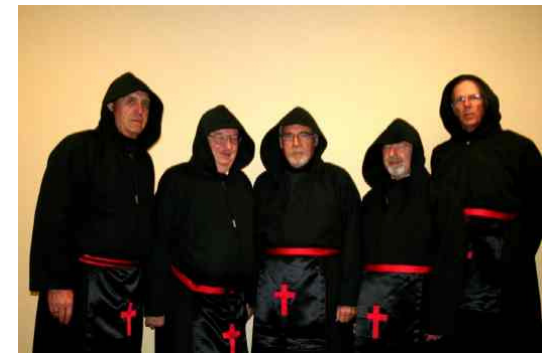
18th Degree Team 2nd Section

A number of Hutchinson County Masons helped to confer the degrees upon the candidates.