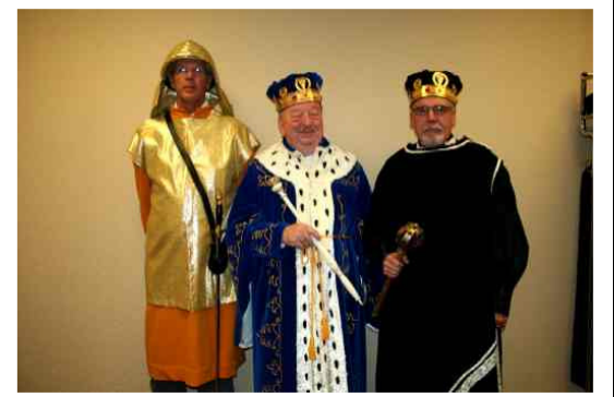
6th Degree Team

On Saturday October 29, 2011, the Lubbock Scottish Rite held their fall reunion. We had 14 candidates.