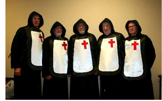
18th Degree Team 2nd Section

A number of Hutchinson County Masons helped to confer the degrees upon the candidates.