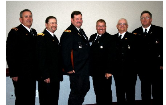
Borger Ritual Team

Borger Commandery #96 also participated in the Ritual Competition. A total of twelve teams competed.