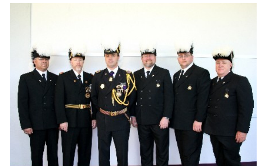
Amarillo Ritual Team

Borger placed 12th in the state with competition being held in Malta Degree. Amarillo Commandery#48 also competed and place 3 rd ..