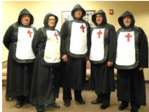
18th Degree Team

On October 20th and 21 st 2013 the El-Paso Scottish Rite held their fall reunion in El-Paso Texas. Degrees were conferred on eight candidates. Congratulations to all the new Scottish Rite Masons.