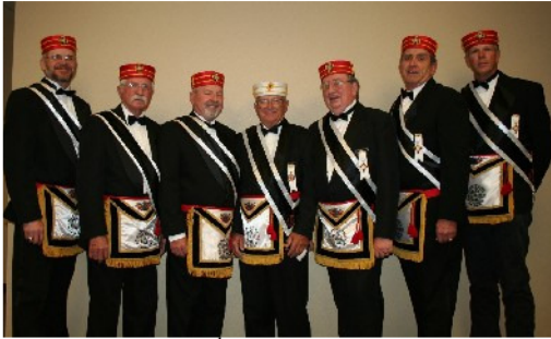
32 nd Degree Team

On Saturday October 5, 2013 the Lubbock Scottish Rite held their fall reunion at the Scottish Rite Temple in Lubbock Texas. Degree Teams from Borger and Amarillo conferred the Terminal Degrees on three candidates.