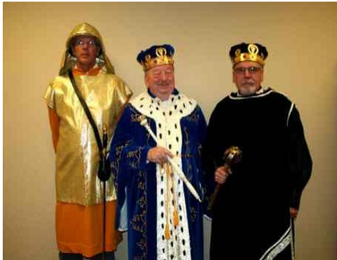
6th Degree Team

On October 17th and 18 th 2014 the El-Paso Scottish Rite held their fall reunion in El-Paso Texas. Degrees were conferred on six candidates. Congratulations to all the new Scottish Rite Masons.