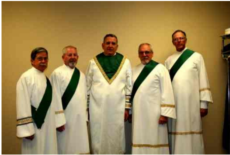
26th Degree Team

On October 24, 2014 and October 25, 2014 the Lubbock Scottish Rite held their fall reunion at the Scottish Rite Temple in Lubbock Texas. Degree Teams from Borger and Amarillo conferred the Terminal Degrees on four candidates.