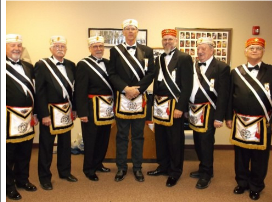
32 nd Degree Team