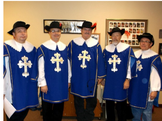
Amarillo 30 th Degree Team

On October 17 th and 18 th 2014 the El-Paso Scottish Rite held their fall reunion in El-Paso Texas. Degrees were conferred on six candidates. Congratulations to all the new Scottish Rite Masons.