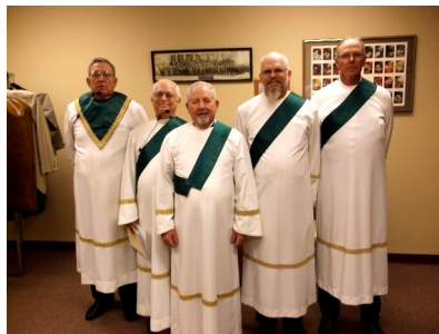
26th Degree Team

On Friday and Saturday October 23 rd and 24 th the Lubbock Scottish Rite held their fall reunion at the Scottish Rite Temple in Lubbock Texas. Degree Teams from Borger and Amarillo conferred the Degrees on three candidates.